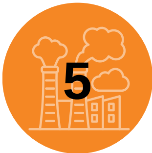
Greenhouse Gas Emission Reduction Projects

In 2023, with the direct support of Green Economy London, the members completed 14 sustainability projects.