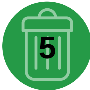
Waste Reduction Projects