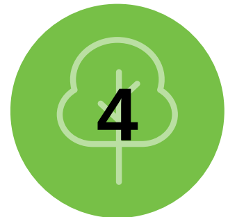
Environmental Stewardship Projects